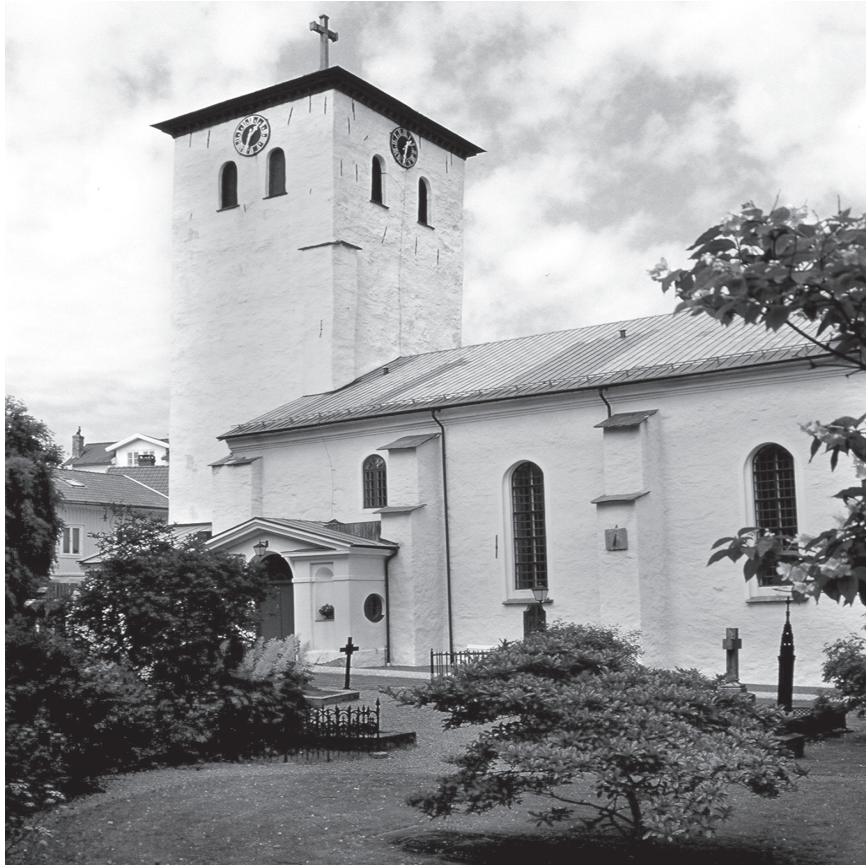
Figure 5. Mariakyrkan in Marstrand, facing northwest. The remains of the Franciscan friary partially excavated between 2017 and 2018 are located in the cemetery area on the left hand side of the photograph.

built something on Marstrand. The key question here is what he did build. For reasons that will be further developed in the following, I reject the idea of any town-like settlement on Marstrand before the turn of the 14th century. In my view, it is not until the second part of that century that there are somewhat clearer evidence of the existence of a town. However, even if one accepts that the town of Marstrand was formally founded by King Haakon, there is a need to explain what his build-