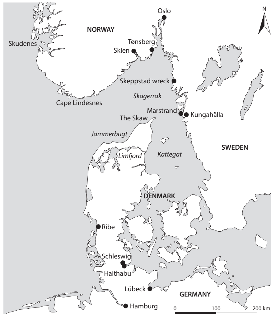
Figure 1. Map showing some of the more important locations referred to in the text. Illustration: Anders Gutehall, Visuell Arkeologi .

development of the town and its different institutions was perhaps not as straightforward as has often been assumed. It should be stressed, though, that the importance of ummeland voyaging in this context has been addressed to a certain extent also by previous scholars (Lönnroth 1963, p. 111; Carlsson 1984, pp. 53–56; Andersson 1988, pp. 179–