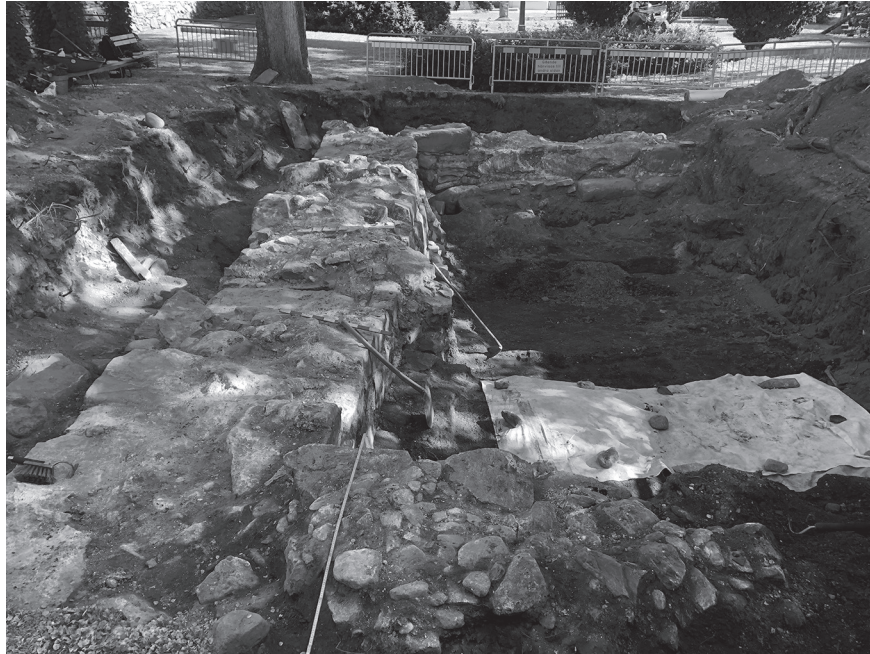
Figure 6. Excavation in 2017–2018 of the remains of the Franciscan friary in Marstrand revealed massive stone walls, representing the foundation of a large building to the south of Maria-kyrkan, in what today constitutes the church's cemetery. The building has been 34–35 metres long and 12 metres wide, and was orientated in an east–west direction.

Larsen 2015, pp. 296–297), and in the late middle ages, they were involved in the issuing of letters of indulgence, which became an important source of income (Digernes 2010, pp. 77–79).