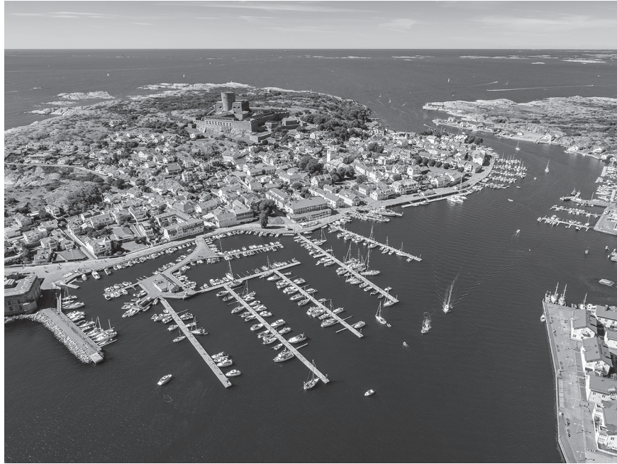
Figure 4. Aerial photograph showing Marstrand and part of Köön. The 17th-century fortress Carlsten sits enthroned over the town and its sheltered natural harbour. The church with its tower is visible among the houses, just above the centre of the photograph.

both refer to Erik Lönnroth (1963, pp. 111–112).