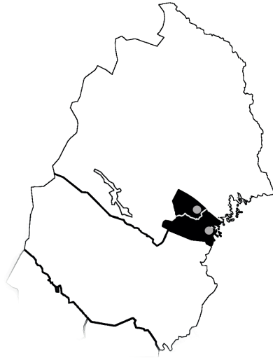
Figure 1. Map showing the study area.

the Piteå and Älvsbyn municipalities in the south-eastern parts of the county of Norrbotten (Fig 1). This analysis draws on archaeological remains, historical records, place names and oral tradition among Sámi as well as local villagers. Inter-community relations are analysed and interpreted as they have played out in the landscape, specifically in relation to the concept of Lappmarker and the establishment of the Lapland border (Sw. Lappmarksgränsen ) in the middle of the 18th century.