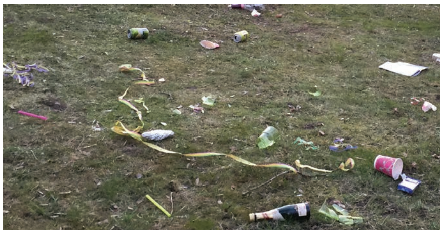
Figure 8. Conceptions of waste are time and culture bound. If one arrived in Turku on the first of May, (s)he would get a completely different image about the manners of the people and sanitation of the town than in other times. Every year, despite organised waste management and instructions, the traces of celebration can be seen everywhere until they are cleaned with extra effort and costs.

However, based on available material and studies, it seems that there were actions and practises related to organized and systematic waste management from the late 14th and early 15th centuries onwards in Turku. The organized sanitation was probably catalysed by new ideas, legislation, population growth and intensified activities in the urban sphere. New ideas about sanitation were not, however, necessarily connected to population growth everywhere. James Deetz, who studied three cities from the 18th century, discovered that all cities adopted new ideas related to sanitation simultaneously regardless of the size, situation or social status of the cities (Deetz 1996, p. 171–174). Deetz's study demonstrates that changes in sanitation can be connected with mental and attitudinal changes rather than with the