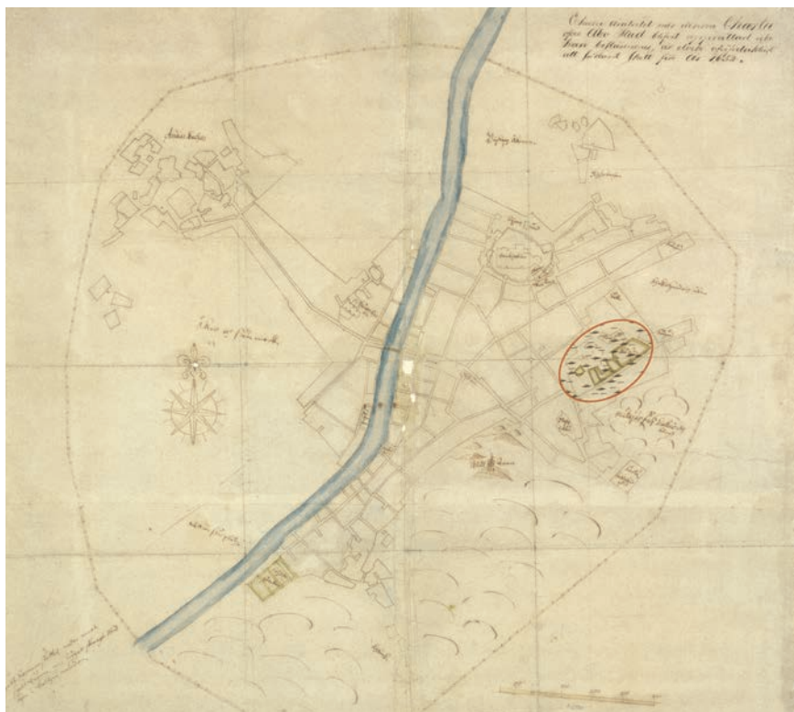
Figure 2. The location of Mätäjärvi has been marked with a circle and texture on the oldest map of Turku from the 1630s. On this map, there is no visible evidence of the lake and the only reference to the lake is the name of the hill (Mätäjärvi hill) on the south side of the marked area. The map does not provide any information about the medieval brooks either.

and animal excreta, which could have been used as manure in fields (Seppänen 2012b, p. 867, 872). When waste is used intentionally for fertilisation and as fill, insulation and absorbent material, it meets the criteria for recyclable waste and useful material and cannot be considered just waste any longer.