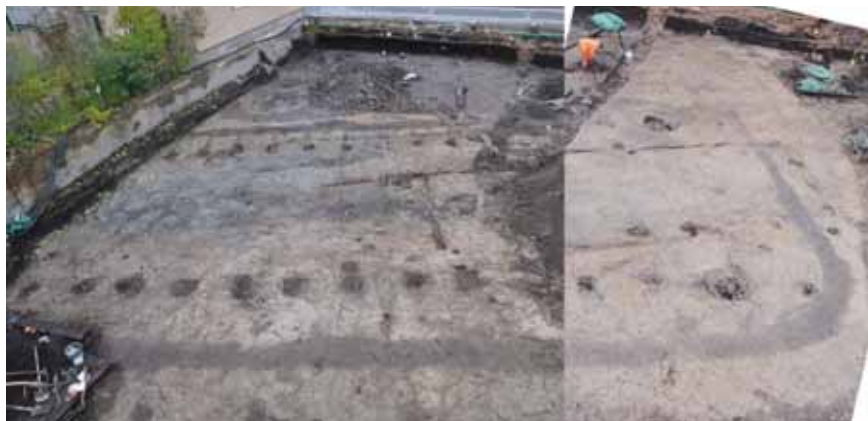
Figure 2. Merged photographs of naust A. The building was excavated in two sections in Åkroken 3 due to dump-management. The southeastern part of the building was situated underneath the wall to the left in the picture within Åkroken 4. Photo from the northeast. 2010

0,3-0,7 meters in depth and they contained 0,02-0,1 m 3 of rounded stone material as support. The variations in depth depend on damage done by modern disturbances. Several results from the wood-analysis conducted on wall posts found in situ proved that they also were of oak. The southwestern long side of naust A had, compared to the opposing one, a slightly different constitution. Here, only a single row of wall postholes was encountered. However, at the majority of the postholes there were, from the enclosing trench to the former perpendicularly running smaller furrows. The furrows were 0,5-1,2 meters in length, 0,2-0,3 meters wide and 0,1-0,2 meters in depth. These have been interpreted as being imprints or cut furrows for hosting horizontally placed logs on which angled supports similar to buttresses were erected and fastened on the outer side of the roof supporting wall