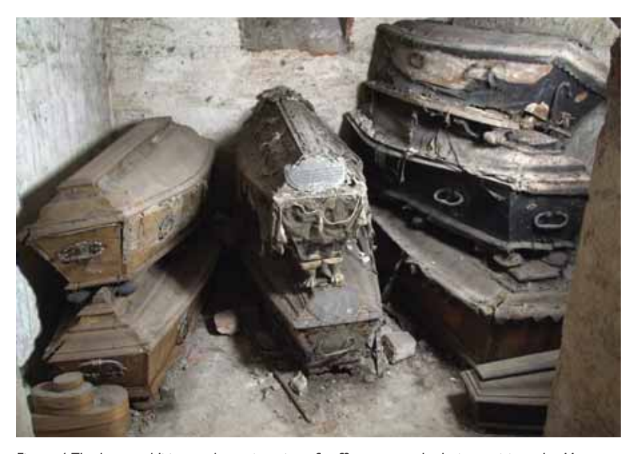
Figure 4. The latest addition to the registration of coffins was made during a visit to the Maasenbach burial chamber in Uppsala Cathedral in June 2011.

From the complete material, including the coffins from Domkyrkan, it is possible to outline a typology