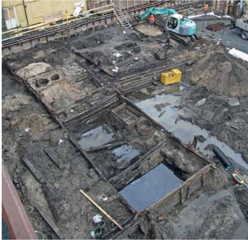
Figure 1. Aerial photo from the 2008 excavation at the Ansaret block, Jönköping. The caissons of the plots are visible.

as analyses based on empirical observations now tend to take place in dynamic intersections where new approaches tend to combine social organization and agency with spatial and material dimensions. The household as a unit for organizing property, production and consumption is confronted with the household as ideology, discourse and manifestation. The relationship between the physical house and the household as a social unit is no longer evident and has to be discussed. This makes possible new per-