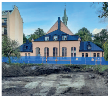
Figure 7. One of the garden quarters, where white sand was laid out, most likely to create a contrast to the darker paths and cultivation beds.

The excavated garden was located in the Rosendal quarter, on the outskirts of 17th-century Stockholm, and was owned by a vicar in the latter half of the century. He was a highly prestigious individual, serving as the priest to the court and queen (Hållans Stenholm & Lindeblad 2023). The garden remnants in Rosendal appear to be unique within a Swedish urban context due to their complexity, variability, and exceptionally diverse and well-preserved archaeobotanical material. Plant residues, as well as finds related to fertilisation and soil improvement, were abundant. These discoveries significantly contributed to understanding the varieties of cultivated plants and