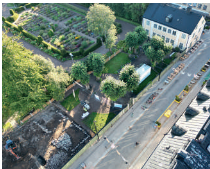
Figure 8. The reconstructed Linnaeus Garden and private home of the Linnaeus family in Uppsala, with the excavation in the left corner of the picture.

mial classification system for plants and animals). In 1741, Linnaeus was installed as Professor of Medicine and Botany at Uppsala University and subsequently, he and his family moved to the newly renovated Prefect accommodations adjacent to the likewise renovated botanical garden (figure 10). The renovated botanical garden was designed based on Linnaeus's new classification system and organised after the seasons. In the back of the garden, a modern orangery had been built for cultivating and preserving exotic tropical plants.