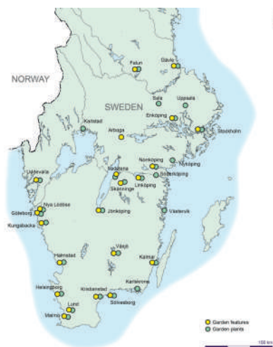
Figure 1. Map of the southern parts of Sweden showing where garden features and plants have been identified through archaeological excavations in medieval and early modern towns. Illustration: The Archaeologists, National Historical Museums.

In this branch of garden archaeology, methods, analyses, and questions have been inspired by Scandinavian landscape and agrarian archaeology, as well as British and American garden archaeology. The objects of research and research questions are constantly broadened, and the latest excavation methods and analyses are used. One example of an important development is the systematic use of archaeobotanical analyses as an integrated part of the excavations (Currie 2005; Lindeblad 2006; Lindeblad & Petersson 2009; Heimdahl 2010; Gleason 2013; Lindeblad & Nordström 2014).