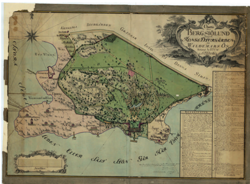
Figure 3. Kökeritz's map from 1777. The pond is seen in the middle of the park. Map from the Land Survey.

to members of the royal circle. The land was either leased or purchased by private individuals, leading to the construction of smaller mansions with accompanying parks.