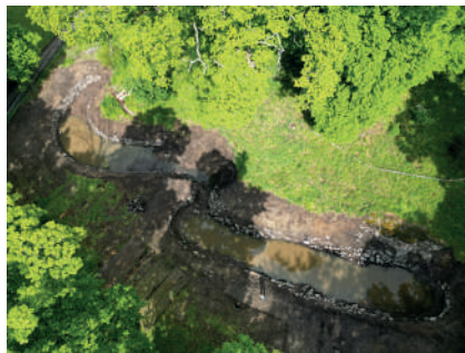
Figure 4. The pond after excavation.

According to the map, the pond had a gently undulating shape and was strategically positioned within the landscape. It was not entirely visible from the south, where the main building was located, but gradually revealed itself upon approach. The surveyor of the map refers to the pond as a "Reservoir." Excavations revealed that the pond had been filled with waste, both from the household and from visitors using the park for recreation. Once emptied, a dry-stone wall lining the interior of the pond became visible, along with a stone foundation for a bridge crossing the pond.