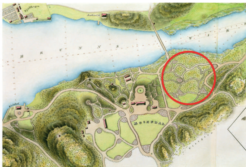
Figure 5a: A historic map from 1834. The red ring highlights the location of the Pleasure ground.

responded with their placement on the 1834 map (figures 5a and b).