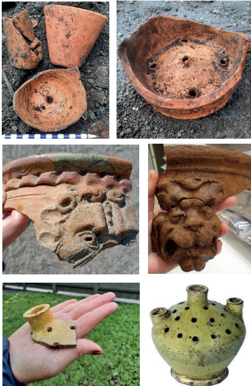
Figure 10a: Examples of planting pots from the Linnean household (left) and planting pots from Frisens park (right). 10b: Two urns from the Linnean household. To the left, a large urn with a Medusa head. To the right, an urn decorated with a lion head. 10c: The sherd of a yellow tulip vase found during the excavation (left), and the exhibited tulip vase in the Linnean museum in Hammarby, just south of Uppsala, to the (right).