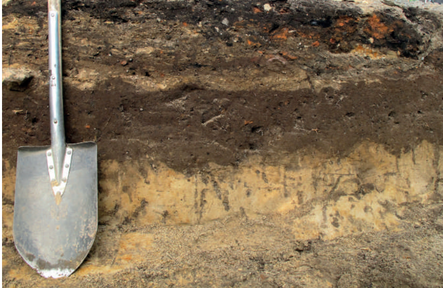
Figure 2. A cross-section of occupational layers containing buried garden soil from an excavation in the town of Norrköping, Östergötland. At the base of the cross-section, within the yellow sand, traces of earthworm activity and root growth are visible. Above this, the brown homogenised buried garden soil can be seen. In the interface between the sand and the subsoil, distinct traces indicate that the garden soil was cultivated using spades.

Lindeblad & Petersson 2009; Lindberg & Lindeblad 2013:79; Lindeblad & Nordström 2014). This method has been developed with the understanding that garden and horticultural remains differ significantly from those of buildings, streets, waste deposits, and conventional occupational layers. Garden soils are typically formed over an extended period and are often largely homogenised due to repeated cultivation. As a result, cultivation layers frequently lack distinct stratigraphy and/or visible structures (figure 2).