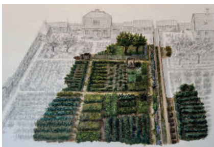
Figure 6. Reconstruction of the garden based on the archaeological results. Jens Heimdahl, The Archaeologists , National Historical Museums.

the Riddaren block on Östermalm, where the terraced garden was dated to the 18th Century (Lindeblad & Hållans Stenholm, in manuscript). Smaller excavations have also been conducted in garden settings, including Piperska Trädgården on Kungsholmen and Björns Trädgård near Medborgarplatsen on Södermalm (Dyhlén-Täckman 2020).