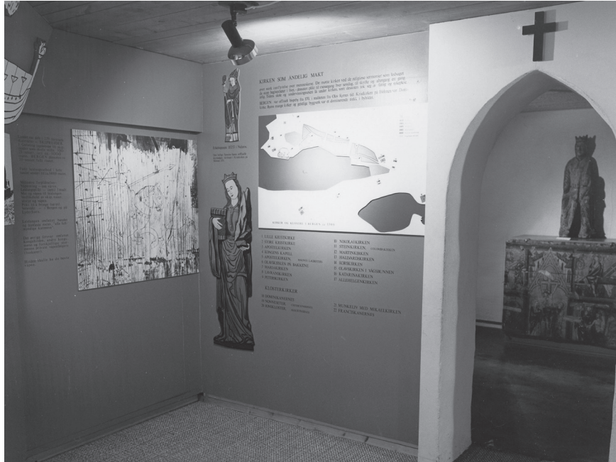
Figure 4. The Church on display.

the exhibition. Artefacts and results from the Bryggen excavation were highlighted, as well as preliminary finds from the ongoing excavation of the small town Borgund outside Ålesund. Neither should the archaeological impact of the extensive excavation site and the impressive “ Big Ship ” be underestimated. In addition, the many colourful thematic stations filled with texts, drawings and other illustrations, as well as the in-depth handbook contributed to an overall impressively comprehensive and informative presentation of the Middle Ages and medieval material culture. Within this context, medieval archaeology and artefacts immediately strikes one as being a