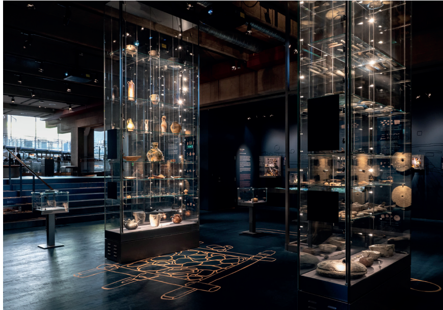
Figure 1. From “Below Ground. Medieval Finds from Bergen and Western Norway” (2020).

and role of the artefact within medieval archaeological research primarily from the 1970s and towards the new millennium initiates the presentation and discussion of the two exhibitions. The analysis of the exhibition from 1976 is mainly based on unpublished archive material – like photos, drawings and documents – and reservations are made that not all content and design elements have been captured. The documentation from the 1986 exhibition, on the other hand, also includes first-hand experiences from my own work at Bryggens museum as senior curator. An inclusion of activities that have taken place in or in relation the exhibitions, other public events, as well as temporary exhibitions may