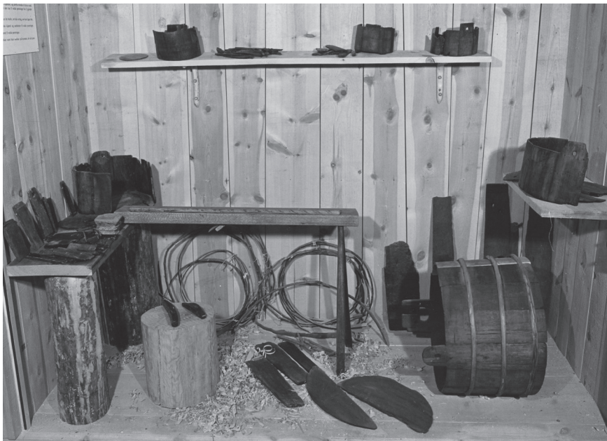
Figure 3. Diorama: “The turner and the cooper” (workshop).