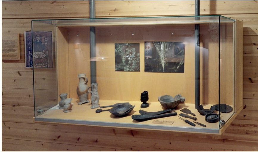
Figure 6. Showcased kitchen utensils.

well as a reconstructed interior, and now inhabited by plaster “mannequins” dressed in medieval clothes. The “tenement” also included built-in showcases with associated archaeological artefacts like toys, kitchen utensils, pottery, gaming pieces, tools, remains of clothes, jewellery and dress accessories (Figure 6). The rearmost part represented a revised and extended edition of “Øvrestretet” from 1976 including “workshops” presenting archaeological remains. Next to the “tenement”, there was a relatively open area dedicated to Bergen as a royal, ecclesiastical and cultural centre. This also included a few showcases, the statue of St. Mary and the altar frontal from the 1976 exhibition, and some remains of columns. All parts of the exhibition and their associated showcases were like in 1976 complemented by texts, maps, photos and other illustrations.