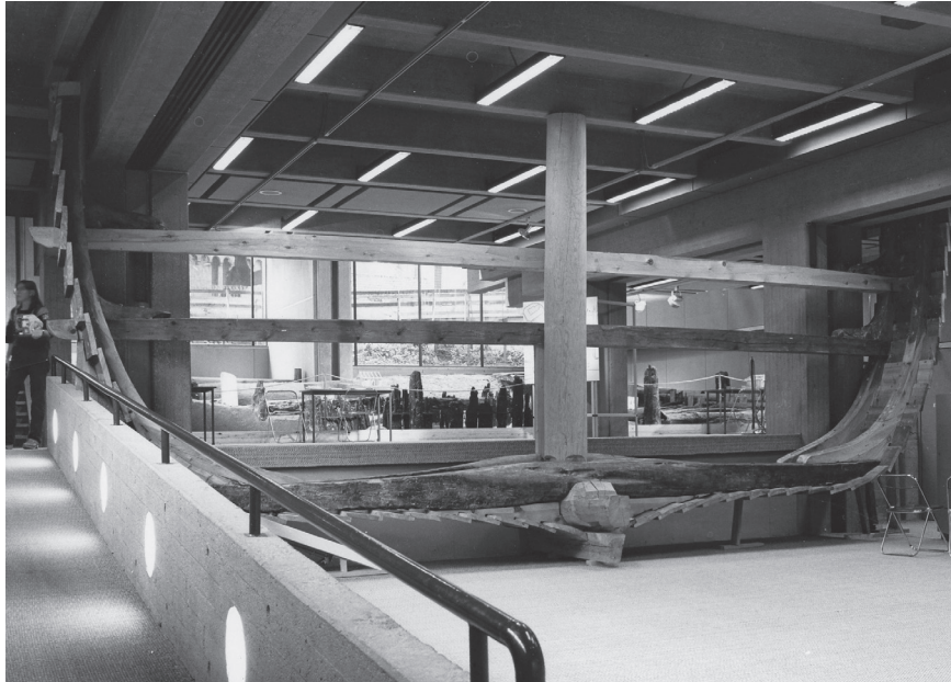
Figure 2. The “Big Ship”. Parts of the “Building Historical Section” is seen in the background, as well as St. Mary’s outside the windows.