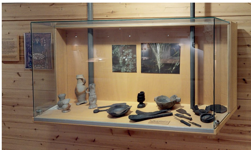
Figure 6. Showcased kitchen utensils.

well as a reconstructed interior, and now inhabited by plaster “mannequins” dressed in medieval clothes. The “tenement” also included built-in showcases with associated archaeological artefacts like toys, kitchen utensils, pottery, gaming pieces, tools, remains of clothes, jewellery and dress accessories (Figure 6). The rearmost part represented a revised and extended edition of “ Øvrestretet ” from 1976 including “workshops” presenting archaeological remains. Next to the “tenement”, there was a relatively open area dedicated to Bergen as a royal, ecclesiastical and cultural centre. This also included a few showcases, the statue of St. Mary and the altar frontal from the 1976 exhibition, and some remains of columns. All parts of the exhibition and their associated showcases were like in 1976 complemented by texts, maps, photos and other illustrations.