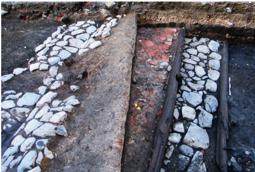
Fig. 7. The photo presents the stratigraphy of different pavements and phases of the School Square. In the oldest phase (on right), the square was provided with a stone paved lane framed with logs. In the next phase (middle), the lane was paved with bricks while the square remained unpaved. The square was paved with stones in the late 15th century or in the early 16th century (left).

102). This information has led to the conception that the squares of Turku were not paved prior to the 18th century. However, the archaeological excavations on School Square in 2005–2006 revealed that the square was paved with stones already during the late 15th or early 16th century when the paving of streets had become more common in Turku (Fig. 7). It is possible, that also the Market Square was paved in the late 15th or early 16th century, since this was the time when the streets in the central town area leading to Market Square were paved with stones. However, evidence about the surfaces and maintenance of squares of Turku can be achieved only with new archaeological excavations.