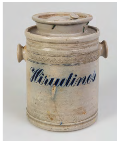
Figure 2. Leech jar from Uddevalla Apotek. Medicinal leeches were usually stored in this kind of jars in the pharmacies.

quity. They were depicted in ancient Egypt 3,000 years ago, and they are mentioned in sources in different languages from the time the nativity of Jesus. In the Nordic countries the use of medicinal leeches for therapy is mentioned by Olaus Magnus in his Historia de gentibus septentrionalibus (1555 book 22, s. 5). It was also mentioned in a Swedish medicinal handbook from the seventeenth century (Lindh 1675, s. 25). However, it was not until the eighteenth century that leeches became more widely used in medicine in Sweden. The wild species is rare in Scandinavia. In the mid-eighteenth century the medicinal leeches used in Sweden were therefore commonly imported from England, according to Linnaeus (Lönnberg 1913, s. 296). Linnaeus named the species Hirudo medicinalis and he was probably describing adult, 10