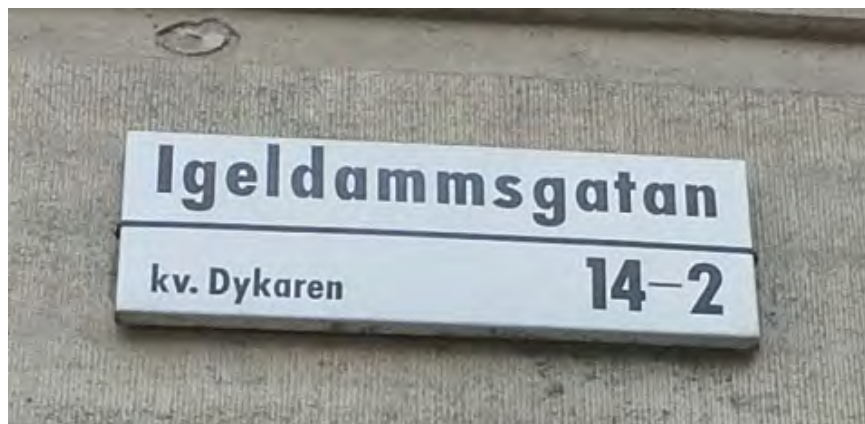
Figure. 1. Street sign for the “Leech-pond Street” in Stockholm

ally keep fish caught in nearby rivers in store-ponds. Another alternative was to produce the fish themselves in breeding ponds. Although fish-ponds for storing and breeding fish, mostly cyprinids, were common in Swedish urban areas in the seventeenth and eighteenth centuries, traces of those are rare (Bonow & Svanberg 2016a, s. 104). A few urban ponds remain though – such as the Svandammen (‘The Swan-pond’) in the centre of Uppsala (founded as a fishpond in 1570). Archaeological remains of former ponds are rare and very few of them have been scientifically investigated (Bonow & Svanberg 2016b). Some toponyms recall now lost ponds, like Zinkensdamm and Ruddammen in Stockholm, Ruddammsgatan in Gävle and the urban block Rudan in Uppsala. There are many other examples (Bonow & Svanberg 2012, s. 139–140).